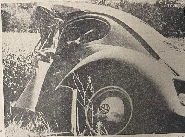
VOLKSWAGEN DEMOLISHED — The front end of this Volkswagen, in which two out-of-state men died instantly, was smashed back into the front seat in a 2-car accident on Highway 6 near Brooklyn Friday afternoon. The demolished auto had to be dragged into Brooklyn and torn apart by two wreckers before the bodies could be removed.