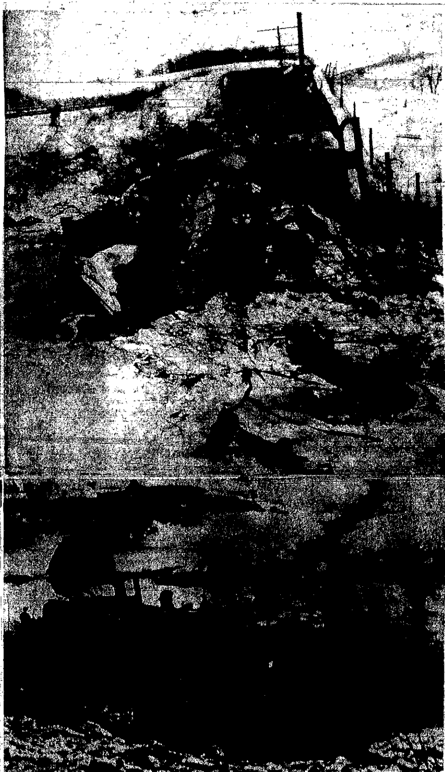
GRINNELL SCHOOL BUS DEMOLISHED: Pictured are two views of the wreckage of a Grinnell school bus after it was struck by an east-bound rocket this morning. The accident occurred at the Turner crossing approximately four miles west of Grinnell. Just starting on its rounds of picking up students, the bus was occupied by four youngsters when the crash occurred. One of the students was killed in the mishap while the other three and the driver were injured.